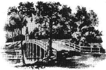
OLD NORTH BRIDGE

TOWN OF CONCORD TOWN HOUSE - P.O. BOX 535 CONCORD, MASSACHUSETTS 01742