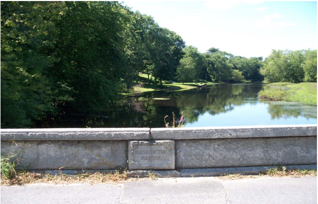
Work Nearly Completed on Nashawtuc Bridge – Reopening Expected By November 30.