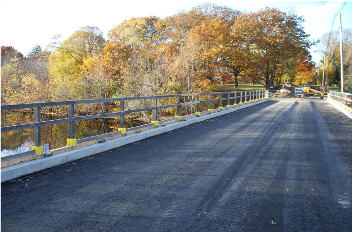
Flint Bridge on Monument St require Railing System and top course of pavement. Some off-road work will carry forward into the Spring of 2010.