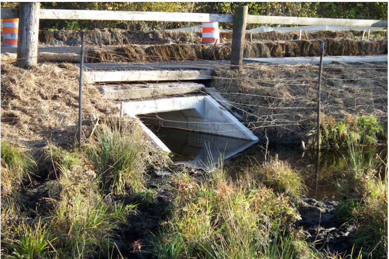
New box culvert installed on Sudbury Road near Suter Field.