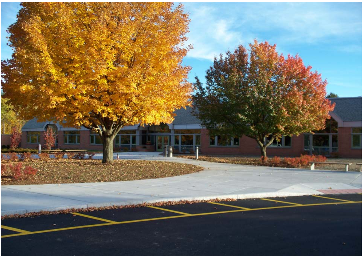
Entrance to new Willard School – Dedication Ceremony Set for November 1, 2009