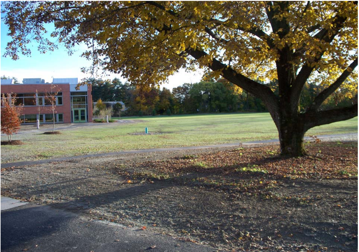
Grass Beginning to grow in playing field area at new Willard School.