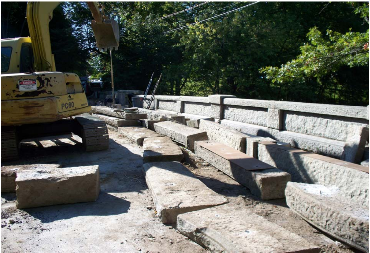
Resetting and repointing of granite walls on Nashawtuc Bridge nearly complete.