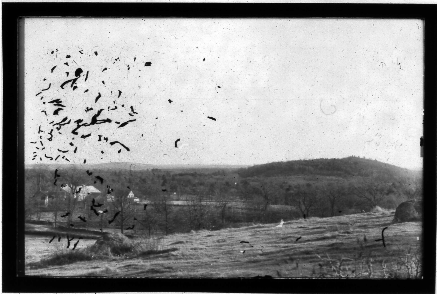
From Strawberry Hill in Acton Towards Annursnac and Fair Haven, November 28, 1903, II1903.35.