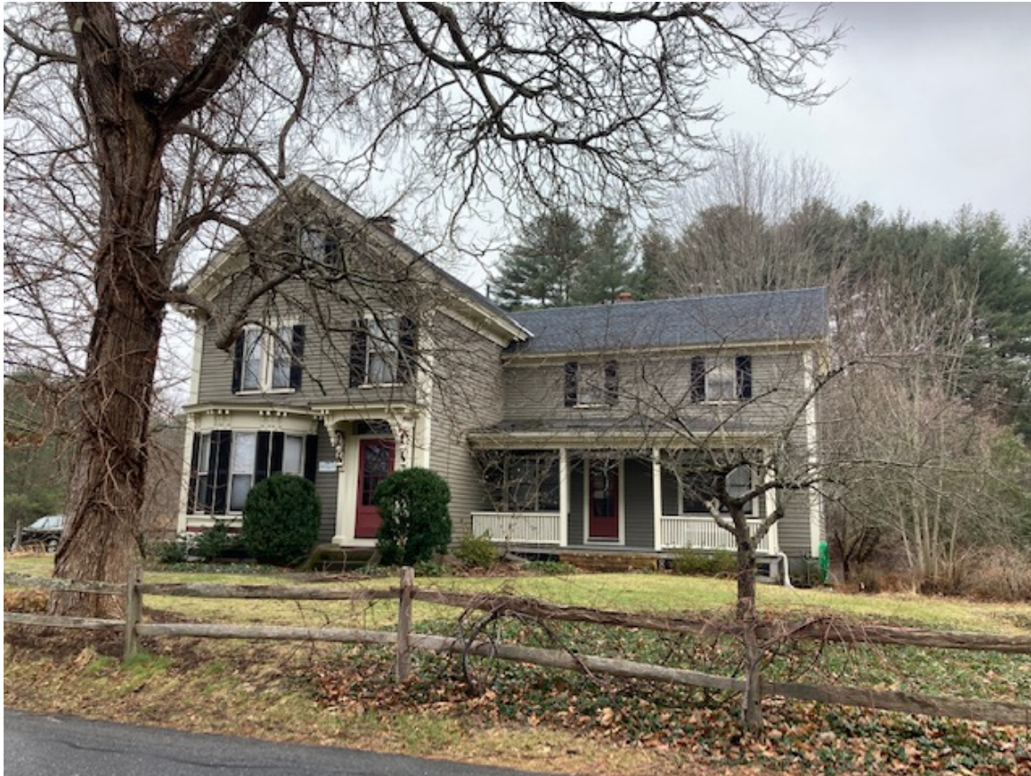
Keefe/Macone Farm House, January, 2021