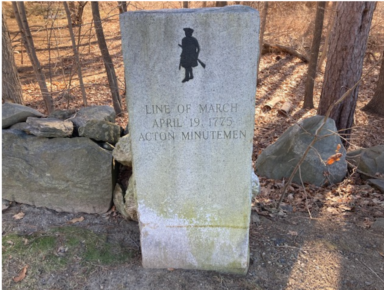
Stone marker denoting the march route of the Acton Minutemen. Located at the junction of Barrett's Mill Road and Strawberry Hill Road. January 2022