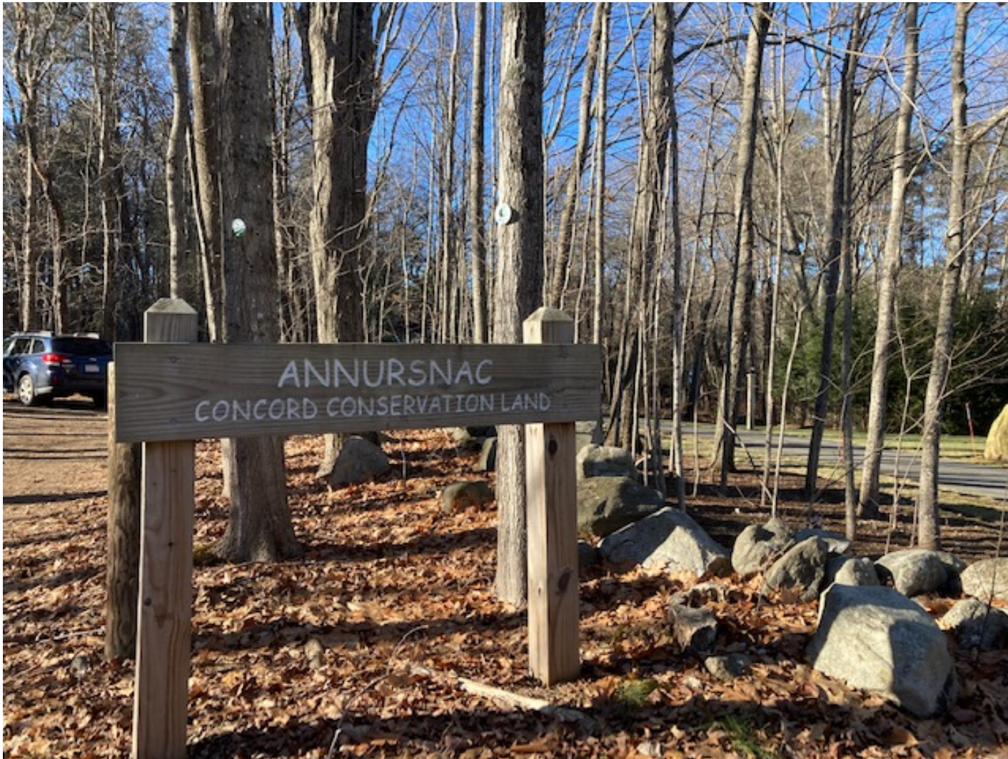
Entrance, Annursnac Concord Conservation Land. January, 2022