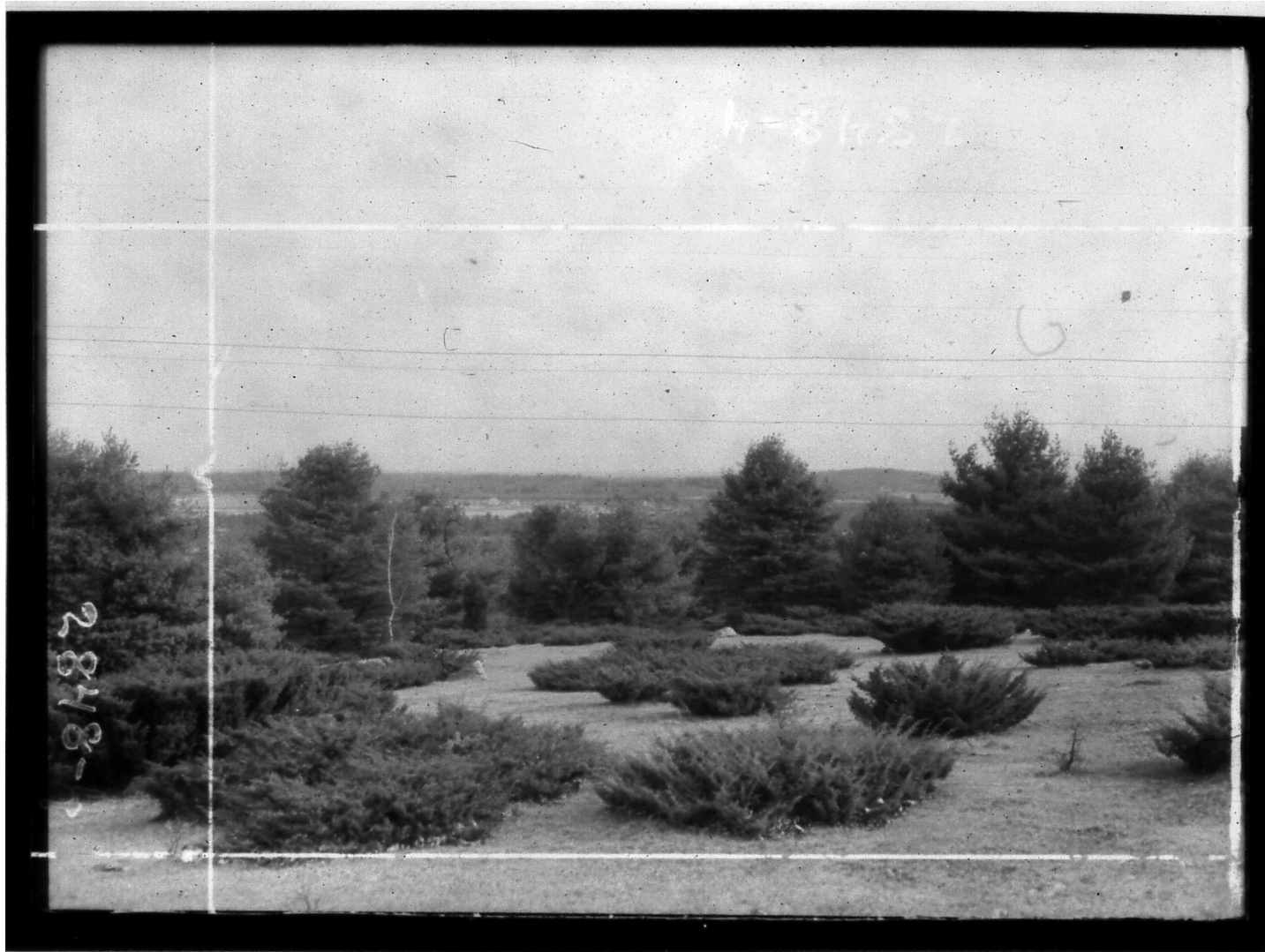
From Annursnac Toward Village, image by Herbert Wendell Gleason, July 30, 1900, II.1900.56, CFPL