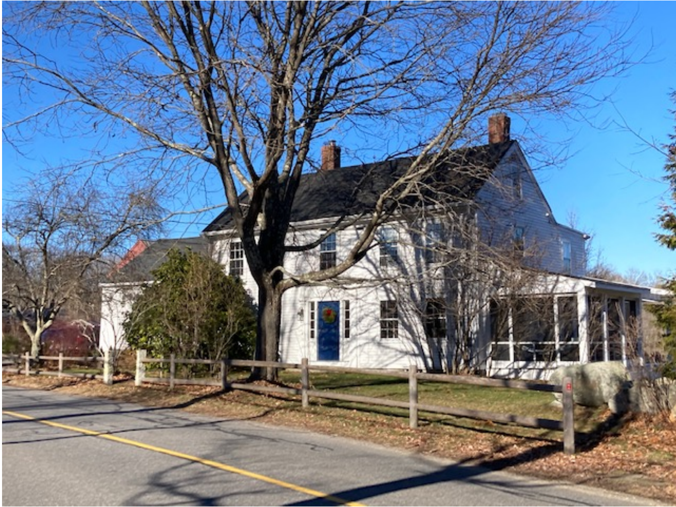
498 Strawberry Hill Road, January 2022