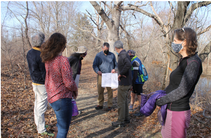
The Junction Village Task Force on a site walk with the consulting designer