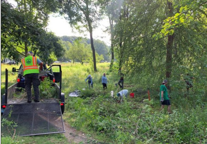
Invasives Removal Project at Heywood Meadow

Barretts Mill Farm, Cousins Field, Heywood Meadow, and West Concord Park totaling nearly 4,500 square feet, and established two more meadows at the Baker Avenue boat launch trail and Harrington Park, for an additional 2,000 square feet. Another meadow was seeded at the Department of Planning and Land Management offices, providing another 1,000 square feet of pollinator habitat.