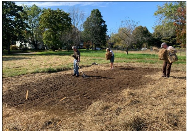
Installing a Pollinator Meadow at Harrington Park