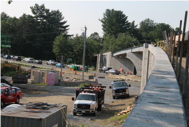
Construction of Phase 2B bridge over Route 2 on the BFRT