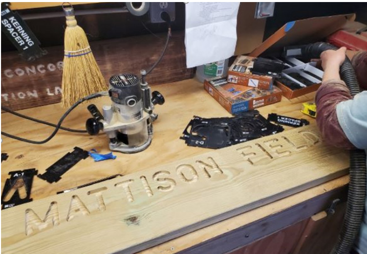
Constructing New Sign for Mattison Field