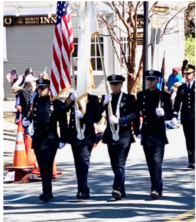
CPD Honor Guard at the 2022 Patriots Day Parade

The Department continues the Craigslist Safe Exchange Program, which allows members of the community to come to the Police station parking lot to complete on-line purchases and sales. Police are encouraging citizens to utilize the Police station, which is equipped with surveillance cameras and staffed 24 hours a day, 7 days a week, as a safe and secure meeting place. Additionally, the Department has utilizes a "First Responder Student Information" sheet to assist officers who might respond to or encounter certain students throughout town, who may require special assistance. This is in addition to an existing service, "Concord Resident Emergency Services," an informational form which increases awareness of the senior population in town, who officers also may be called upon to assist. The Department continues to utilize CodeRed and social media to keep residents informed in a timely fashion as to ongoing in the community. The Department maintains kiosks in the Police Department lobby, which collect unwanted medications and used hypodermic sharps.