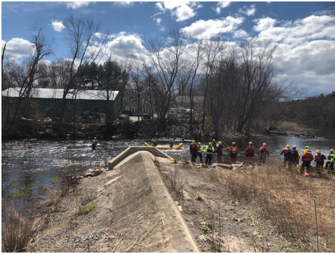
Concord Firefighters participating in a Swift Water Rescue training exercise on the Assabet River.