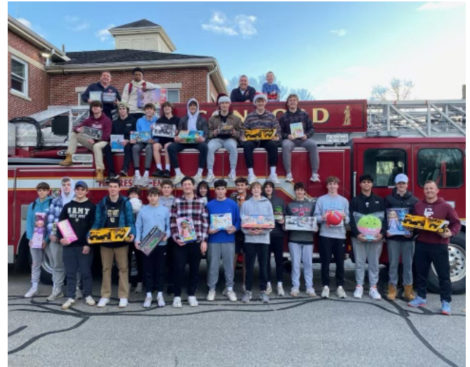
Members of the CCHS Football Team, along with CFD members displaying a sampling of the toys that were collected in a team effort!

All members of the Concord Fire Department actively participate in pre-incident planning of buildings and structures in town. These planning activities include meeting with and speaking to property owners, managers, and employees, becoming familiar with the building's layout, any alterations, and potential hazards. Data is gathered and recorded which can be used to great advantage in the event of an emergency response at these locations.