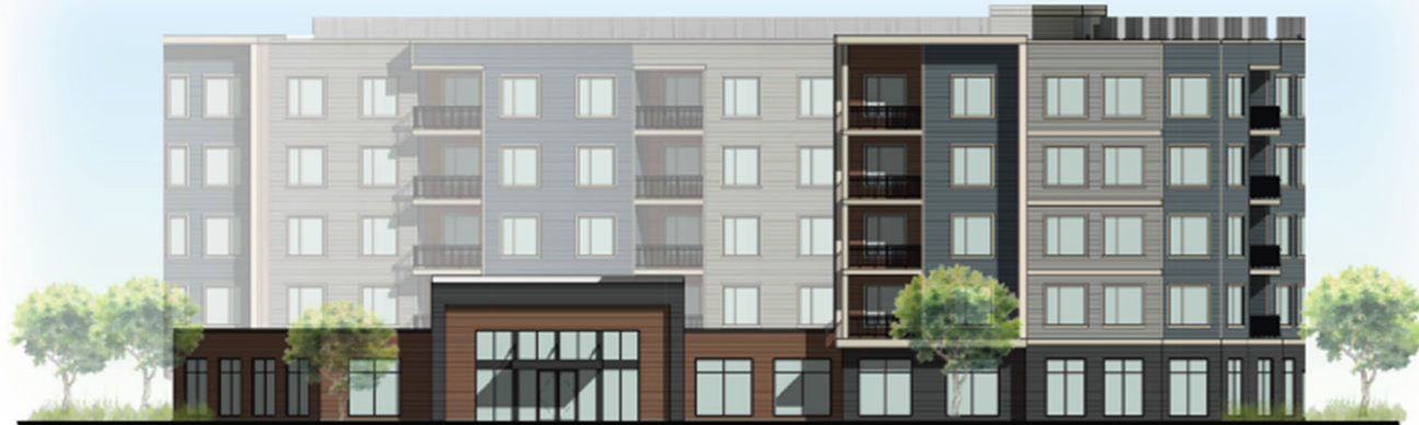
2 BUILDING A ELEVATION - SOUTH-WEST