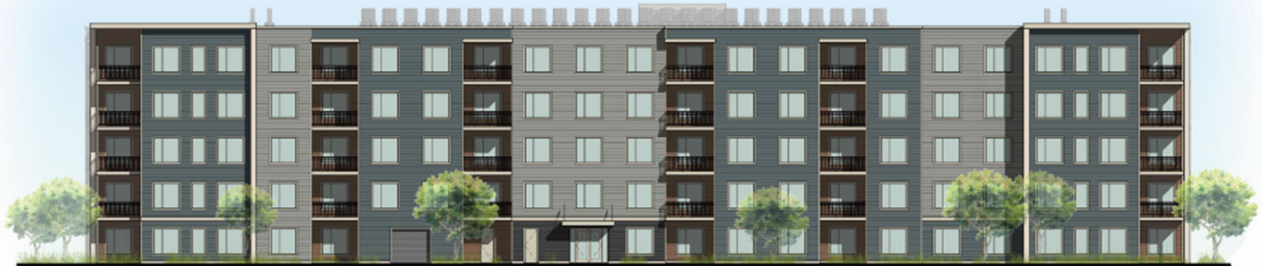
4 BUILDING B ELEVATION - EAST