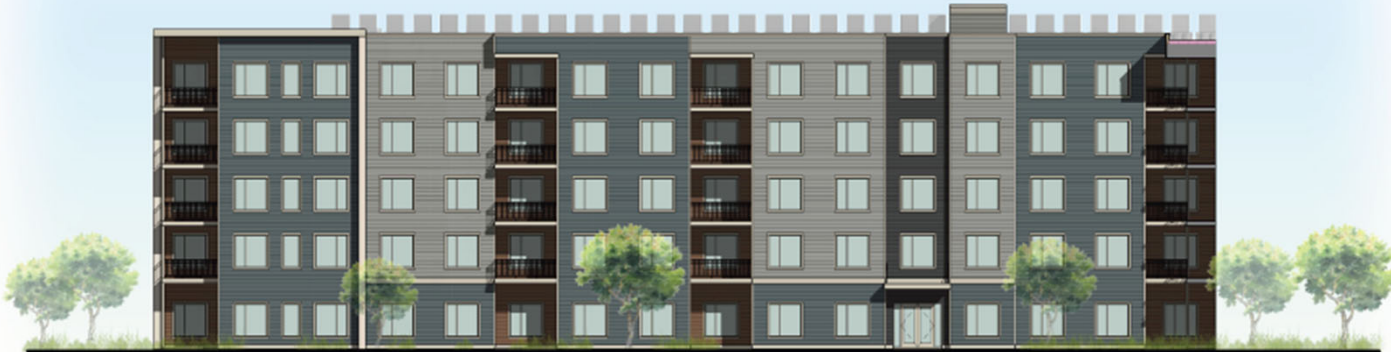
1 BUILDING A ELEVATION - SOUTH