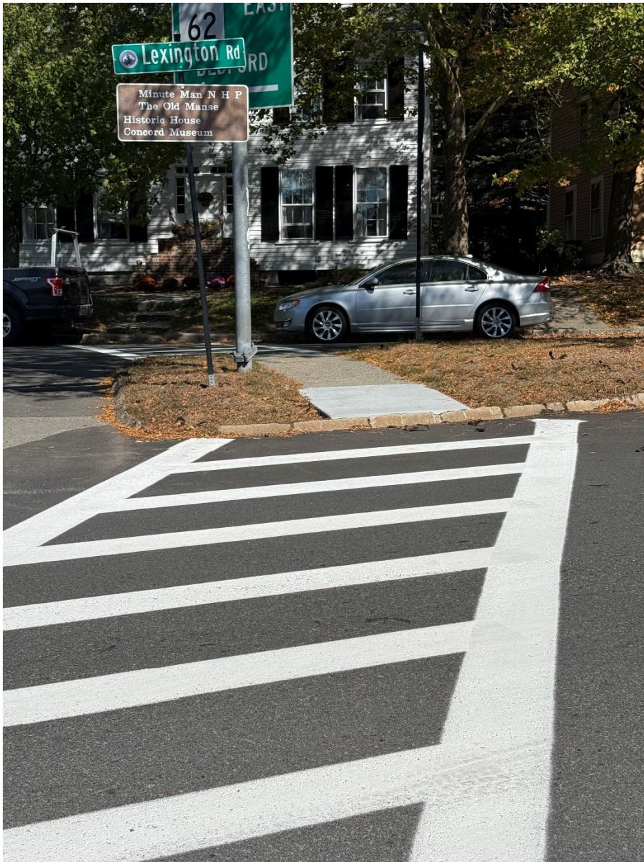
Vehicles Parked at Crosswalks –Near 1 Lexington Rd.