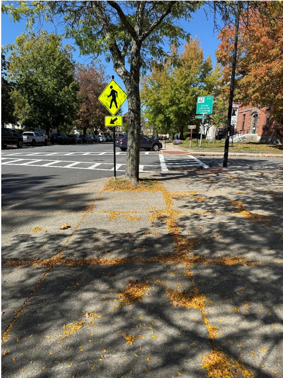
Intersection with pedestrian signs.