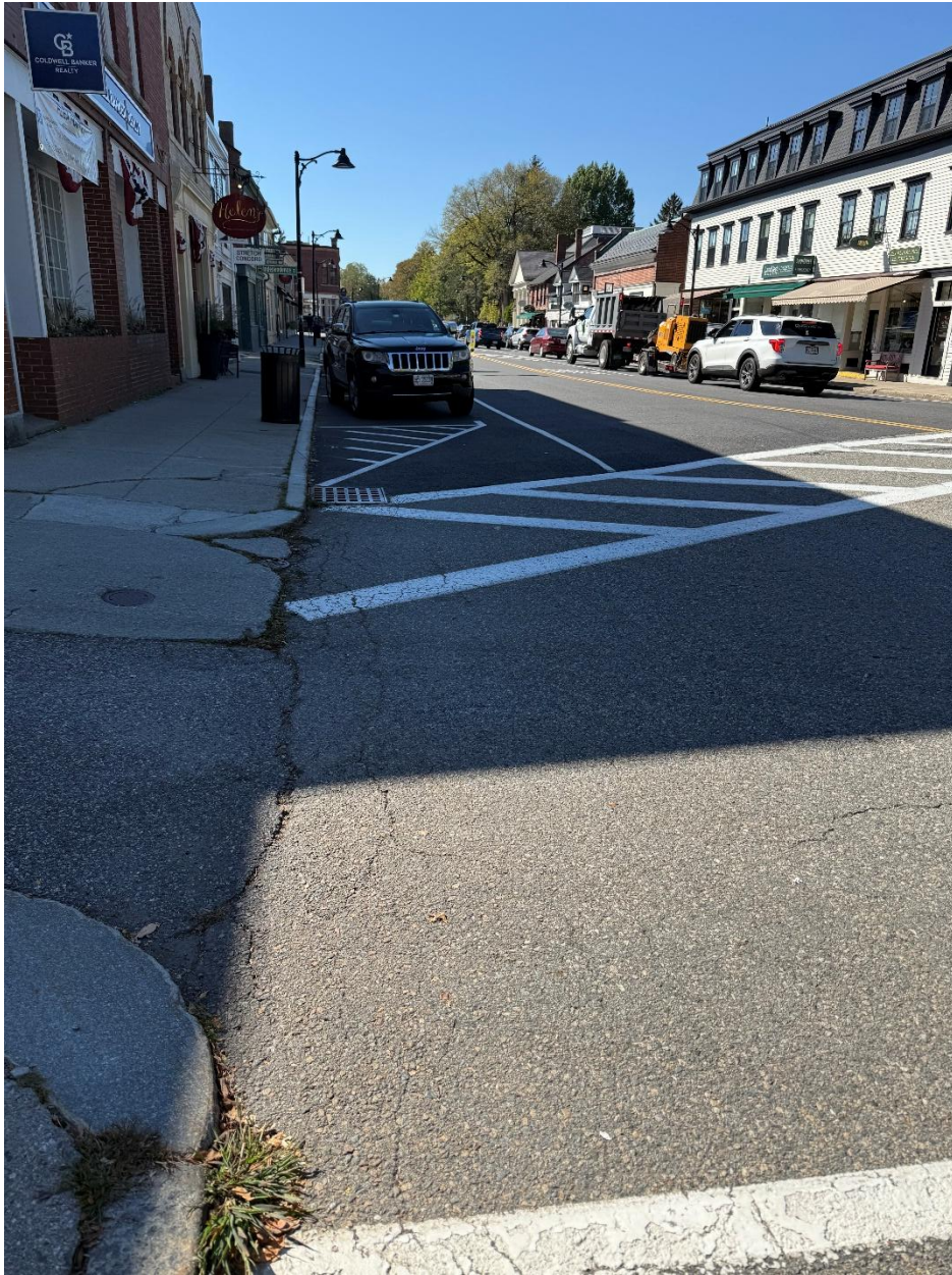
Sightline for pedestrians and traffic entering roundabout at Main St.