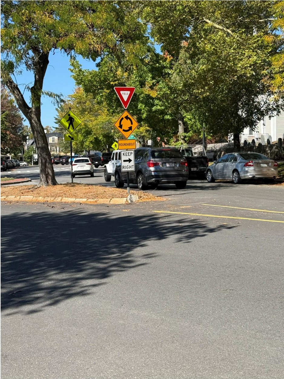
Roundabout with traffic signs including a yield and pedestrian signs near Lexington Rd and Church Green.