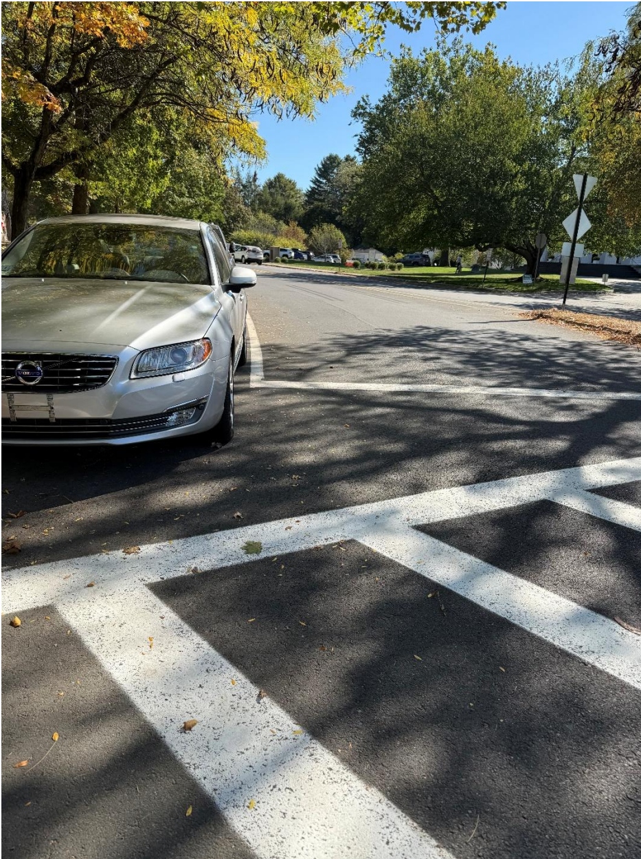
Sightline for pedestrians and traffic entering roundabout at 1 Lexington Rd..