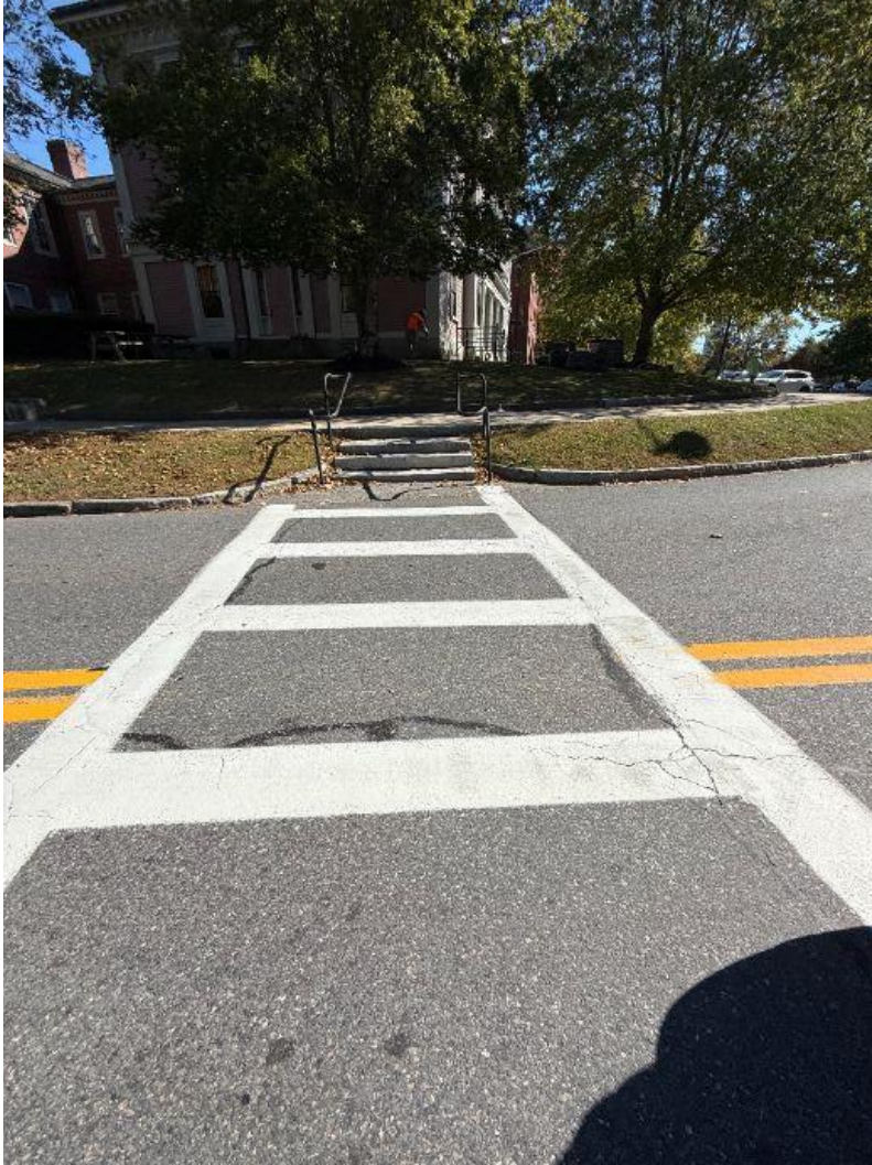
Crosswalk at Colonia Inn towards Town Hall