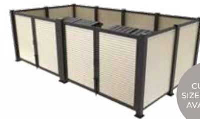
DOUBLE MODEL 1122 (11'D X 22'W X 8'H)