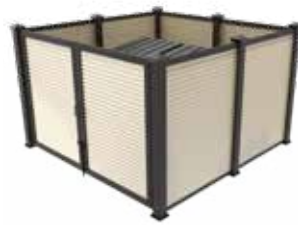
SINGLE MODEL 1111 (11'D X 11'W X 8'H)