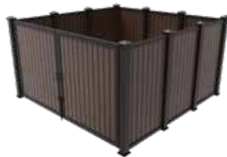
SINGLE MODEL 1313 (13'D X 13'W X 8'H)