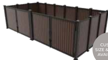
DOUBLE MODEL 1326 (13'D X 26'W X 8'H)