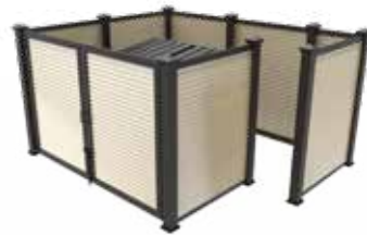
SINGLE WITH WALK-IN MODEL 1111ADA (11'D X 16'W X 8'H)