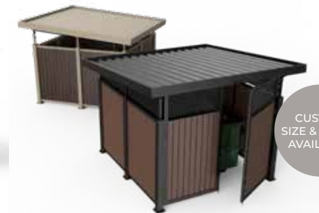
FULLY CUSTOMIZABLE ENCLOSURES (CUSTOM OPTIONS)