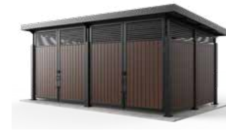
DOUBLE MODEL 1122R (11'D X 22'W X 10'4.5"H)