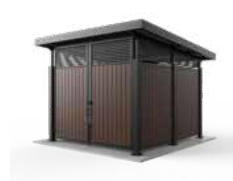
SINGLE MODEL 1111R (11'D X 11'W X 10'4.5"H)