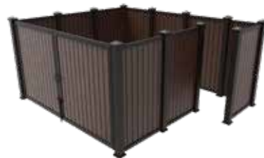
SINGLE WITH WALK-IN MODEL 1313ADA (13'D X 16'-6"W X 8'H)