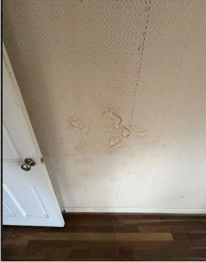
Interior of Home – First Floor Bedroom visible signs of water damage