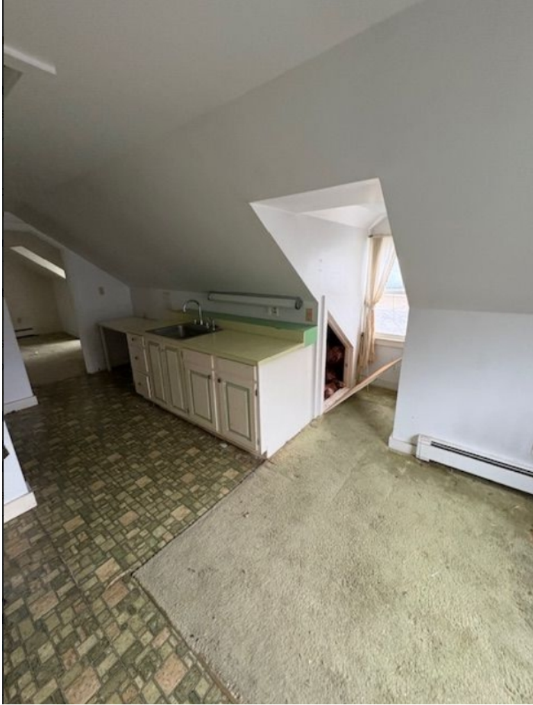
Interior of home – Second Photo showing second floor kitchen area with vinyl and carpet flooring.