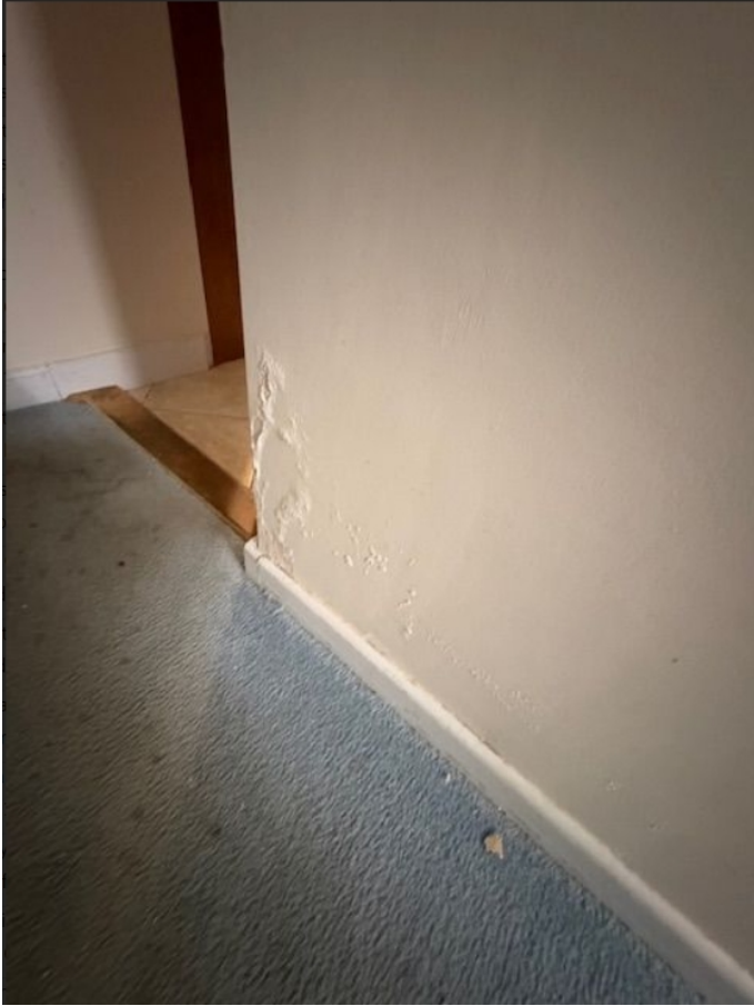
First Floor of Home – Entrance to kitchen shows signs of water damage.