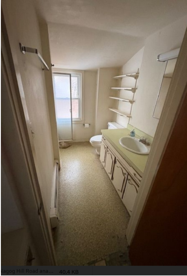
Interior of Home – Second Floor Bathroom with laminated flooring, countertop, and baseboard heat. This was part of the 1979 Addition and Renovation Project.