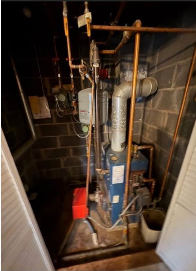
Current extremely inefficient heating system is actively leaking causing water damage to surrounding rooms.