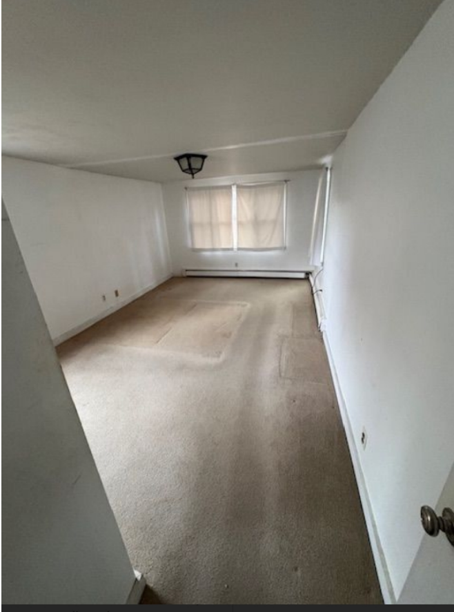
Interior of Home – First Floor Bedroom with carpet over subfloor and baseboard heat.