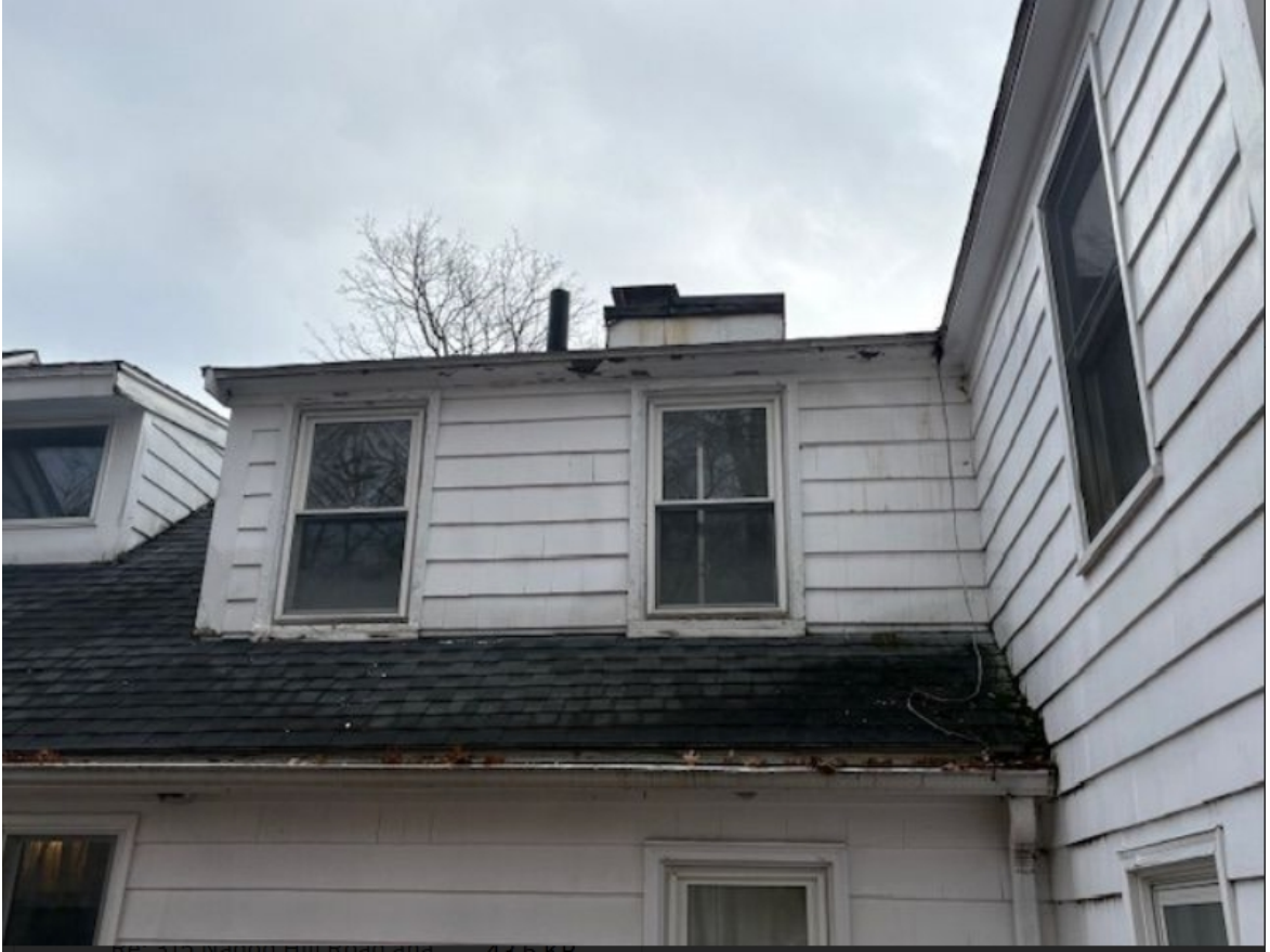
Note: Supplemental photo of rear of home. Dormer to on top and second floor on right were part of the 1979 Addition and Renovation Project.