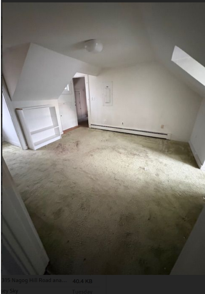
Interior of Home – Second Floor Bedroom #2 with wall-to-wall carpet. This part of the 1979 Addition and Renovation Project.