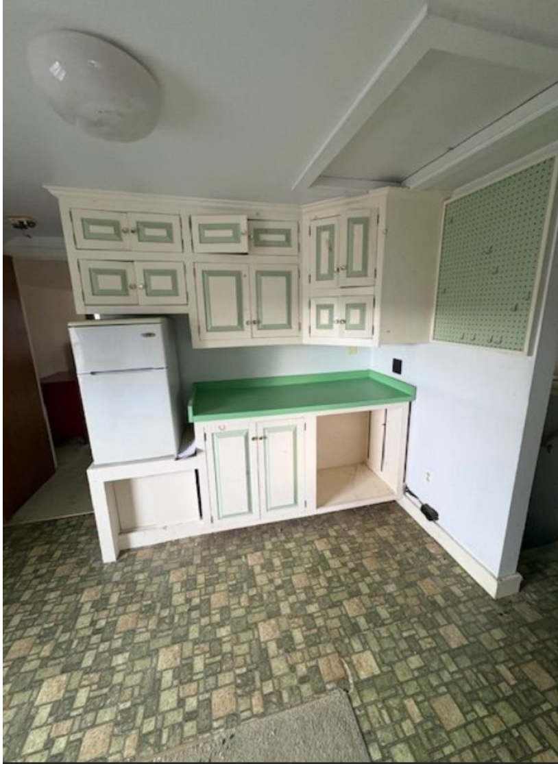
Interior of Home – Second Floor “Kitchen Area” that was an issue between the Town of Concord and the Homeowners as documented within the Building Department File. This was part of the renovation project from 1979. Photo shows laminated flooring and cabinets with laminated countertops. No Second Oven present at this time.