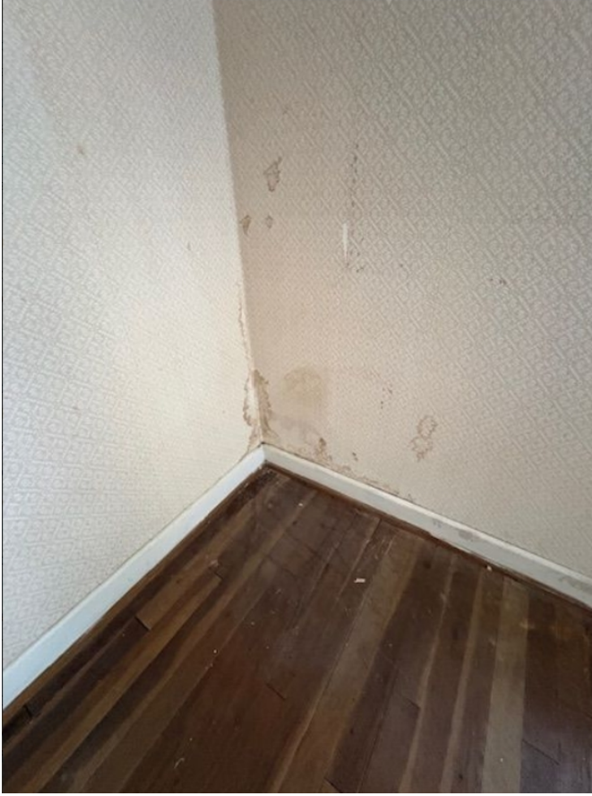
Interior of Home – First Floor bedroom exterior corner of house shows visible signs of water damage.