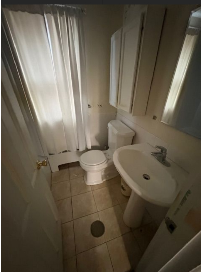
Interior of Home – First Floor Bathroom with tiled floor. Appears to have been renovated at some point in time although no documentation within the Building Departments File.