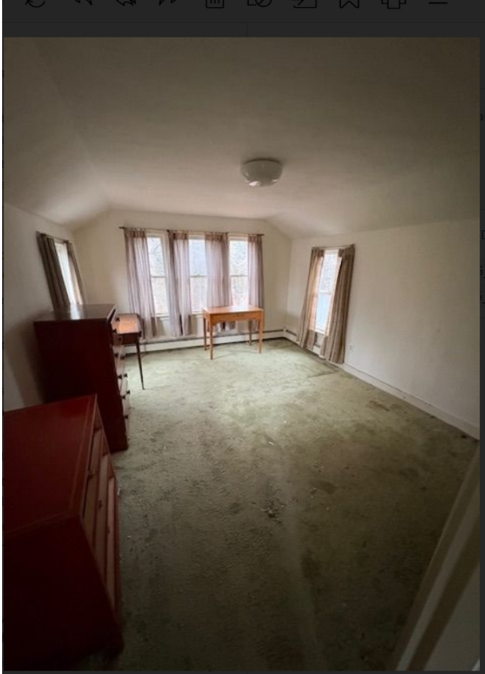
Interior of Home – Second Floor Bedroom with wall-to-wall carpet and baseboard heat. This was part of the addition and renovation project from 1979.