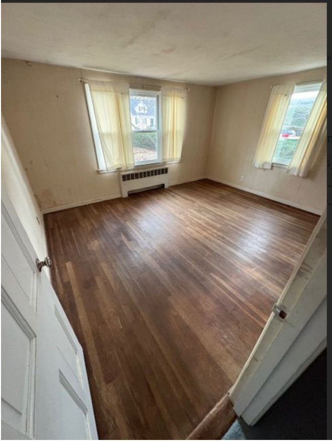
Interior of Home – First Floor Bedroom with 3 ¼” Red Oak Hardwood Flooring. Exterior walls and ceiling show visible signs of water damage.