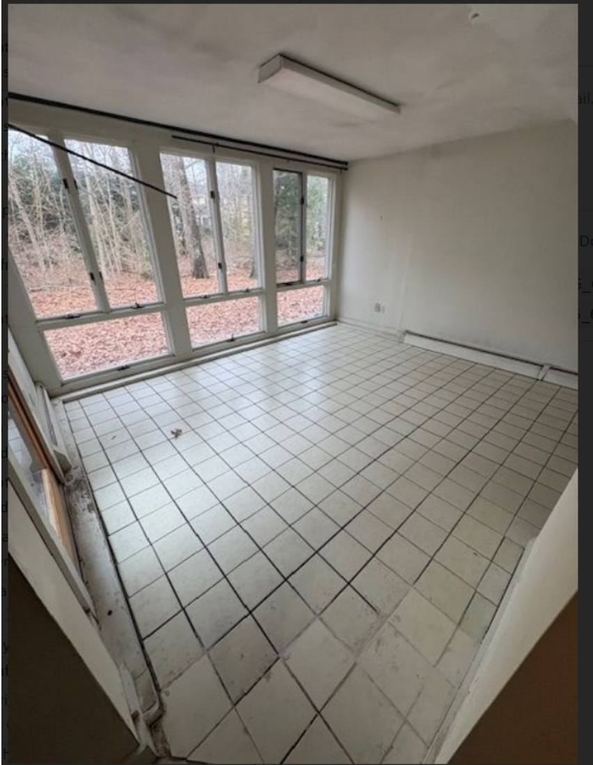
315 Nagog Hill Road ana... 40.4 KB