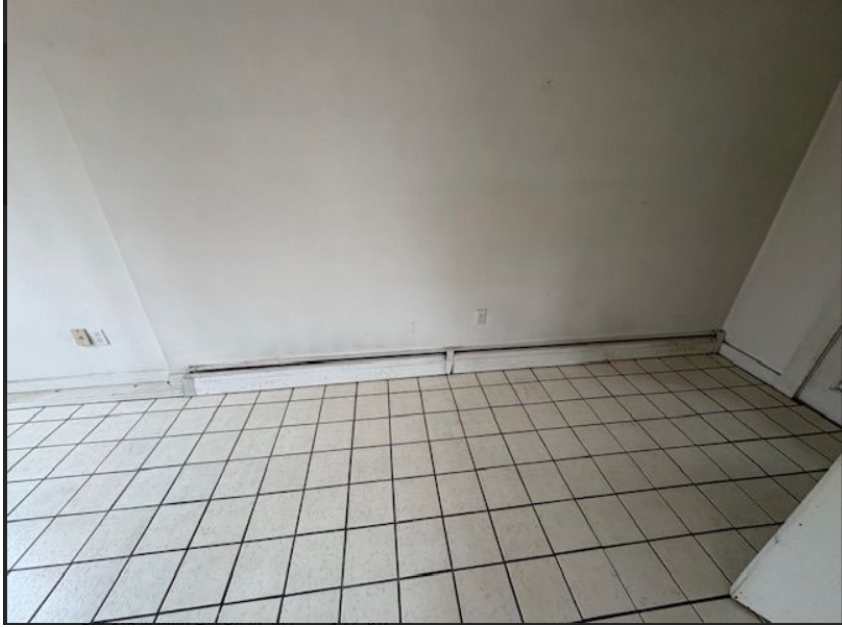
Interior of Home - Rear Additon that was permitted and constructed in 1988 with tiled floor and baseboard heat.