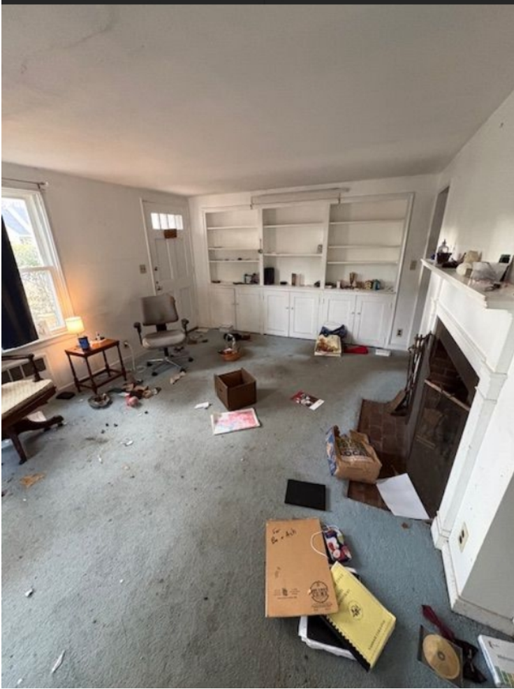
Interior of the home – Family Room with carpet installed over standard 3 ¼” Hardwood flooring. No apparent historical features are present.