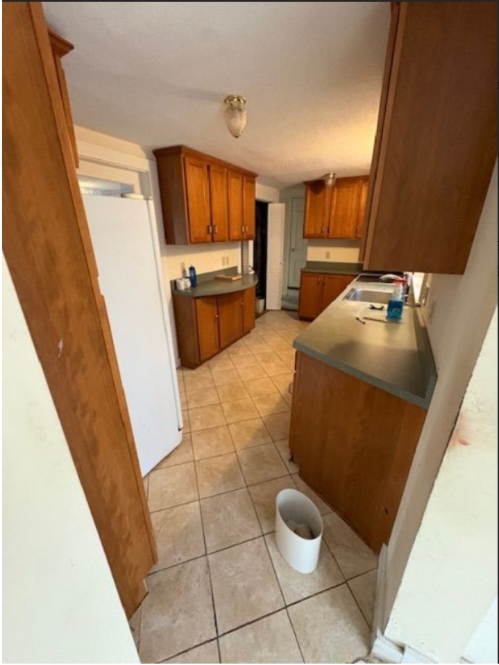
Interior of Home – Kitchen with tiled floor, cabinets, and laminate counter tops completed during a 2009 Renovation.