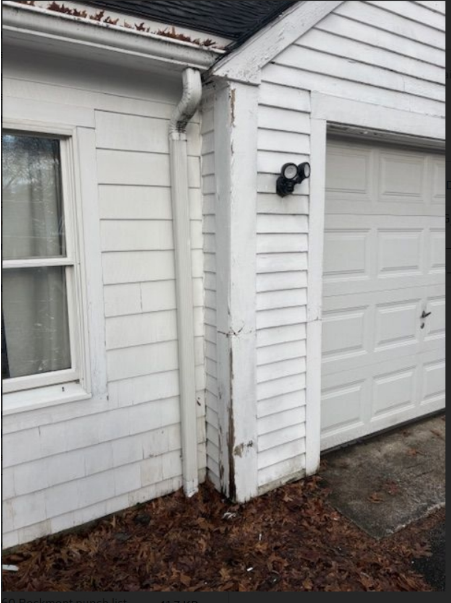
Note: Front Left Corner of Garage – Inside corner of home rotten due to exterior grade at or above the slab level of the home.